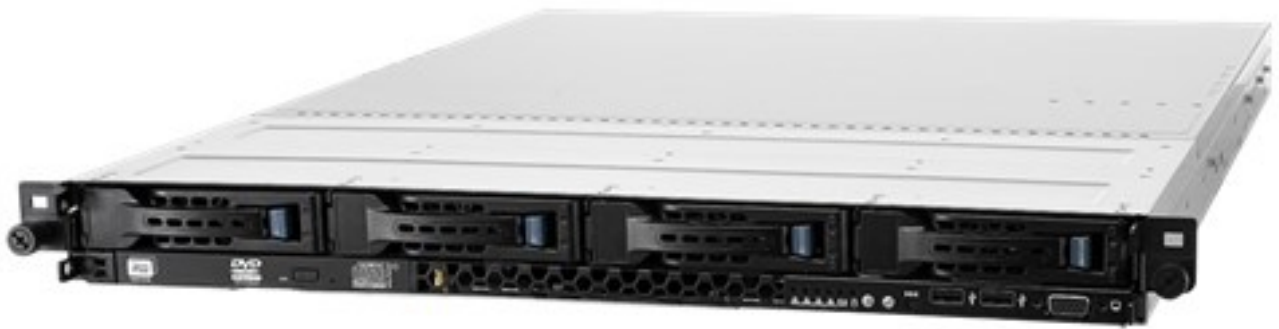
ASUS RS300-E9-RS4 1RU Server Barebone, E3 Socket, 4 x 3.5' HS HDD, 480w RPSU 1 + 1 , 2 x M.2, 4 x DIMM Product Code: RS300-E9-RS4